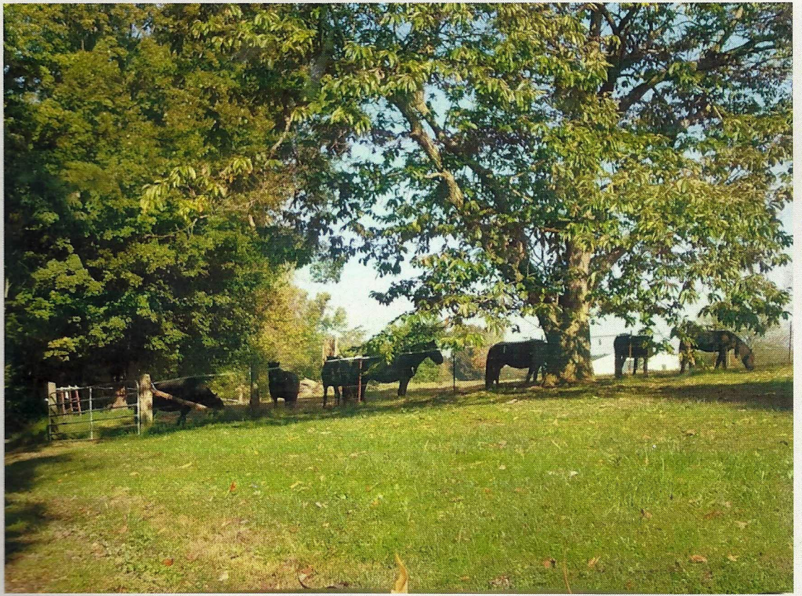
The ponies all settled in their new home

came together seamlessly (believe me though, stress levels were high!). We moved in two trips, household first, livestock second. I'll never forget pulling onto the farm that dark night, hauling 14 animals of various species in my own trailer, with another hauler ahead of me with the remaining 8 ponies. Twelve hours one way, but in true Fell Pony fashion, they behaved themselves beautifully and settled into the brand new place better than I could have ever expected.